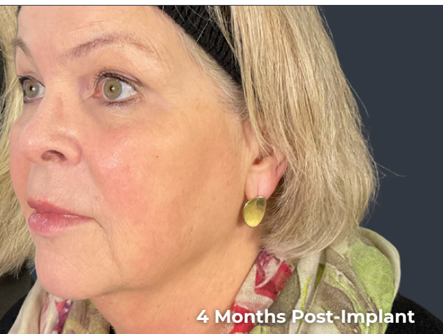
4 Months Post-Implant