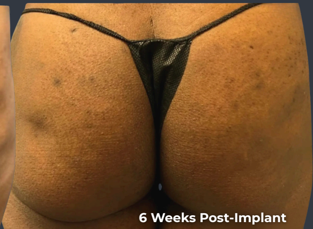
6 Weeks Post-Implant