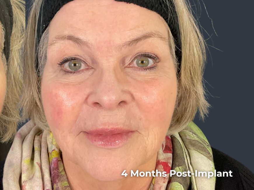
4 Months Post-Implant